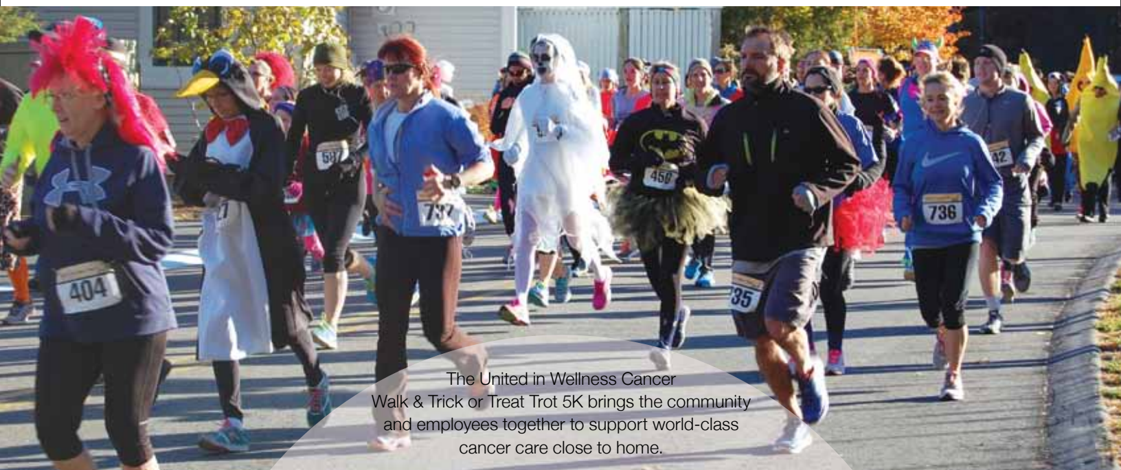
The United in Wellness Cancer Walk & Trick or Treat Trot 5K brings the community and employees together to support world-class cancer care close to home.

Through generous donations of time and funding, many local businesses as well as community members have made it their mission to help ensure future patients have the very best treatment available by supporting the advancement of Exeter Hospital, Core Physicians and Rockingham VNA & Hospice. Some of our grateful patient stories follow on these pages. To learn how you can help, please visit unitedinwellness.org .